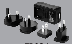
FR08 * 5V SELV USB Power supply*