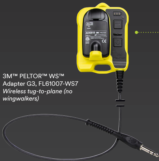
3M™ PELTOR™ WS™ Adapter G3, FL61007-WS7 Wireless tug-to-plane (no wingwalkers)

Introducing the 3M™ PELTOR™ WS™ Adapter G3, Ground Mechanic - the ultimate solution for ramp communication during aircraft pushback operations. With our Bluetooth® technology expertise, we bring you a safe and reliable wireless connection that revolutionizes ground crew communication.