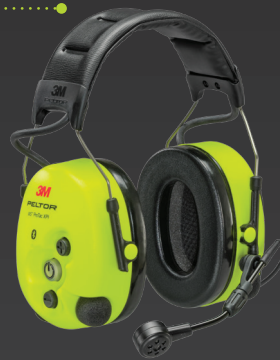
3M™ PELTOR™ WS™ ProTac XPI Communication Headset, MT15H7AWS6 Wireless tug-to-plane (no wingwalkers)