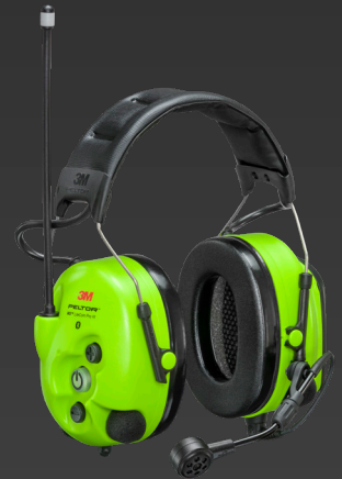
3M™ PELTOR™ WS™ LiteCom Pro III Headset, MT73H7A4D10 Wireless tug-to-plane (with wingwalkers)